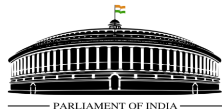
PARLIAMENT OF INDIA